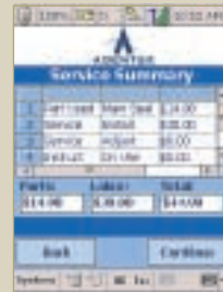
➤ Feature rich applications branded to your specifications

Agent Field Service automates parts inventory and work flow by reducing or eliminating paperwork. Ultimately, mobile automation reduces fixed asset and labor costs and frees field service technicians, giving them opportunities to recommend repairs, parts and extended services proactively, before serious failure occurs. Mobile automation adds true value to your service offering and uncovers untapped revenue sources for your business – increasing margins and potentially helping achieve higher market share through competitive pricing and better customer service.